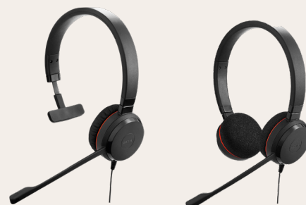
Evolve 20 & Evolve 20SE