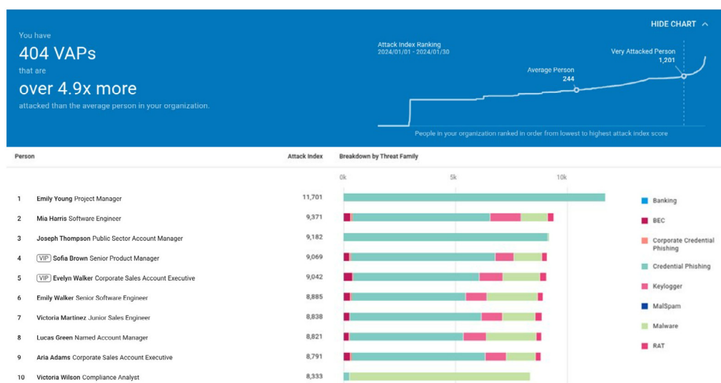
Figure 2: Proofpoint provides people-risk visibility into your Very Attacked People™ (VAPs).

Proofpoint helps you further mitigate your people risk by changing unsafe behavior and building sustainable security habits. We use our rich threat intelligence to inform your program in various ways. These include designing real-world phishing simulations, enabling threat-guided training that allows you to educate your top clickers and most attacked, and automating threat investigation of user-reported email. We help you keep users engaged by providing you with personalized learning experiences. Our adaptive approach helps your people retain what they learn and cultivate positive and lasting security habits. And we allow you to better communicate your people risk and program impact to your leadership team by tracking real-world behavior change and benchmarking it against your industry peers.