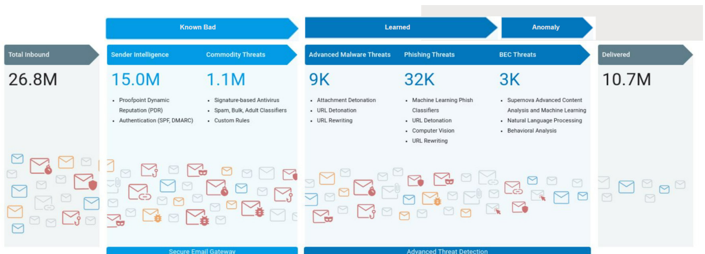
Figure 1: Proofpoint AI-driven, multilayered, pre-delivery detection in action.

We use a multilayered detection stack that comprises threat intelligence, machine learning, behavioral AI, sandbox detection, content and semantic analysis (LLMs). These work together to detect multiple types of modern threats. As a result, the stack delivers a high-fidelity detection rate of 99.99% with better threat explainability. And unlike single-layered detection email security solutions, it yields fewer false negatives and fewer false positives because it can more accurately stop malicious messages without blocking good messages and impeding your business.