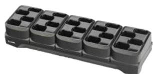
20-slot Battery charger Shared MC33/MC34