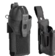
Soft holster for Gun/Straight Shooter (Brick) Shared MC33/MC34