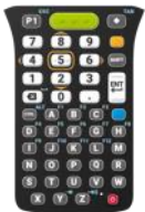
Alpha-Numeric (47 key)