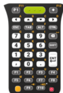
Function Numeric (38 key)