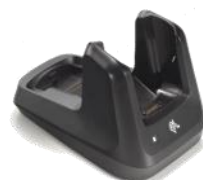
Single-slot cradle Shared MC33/MC34