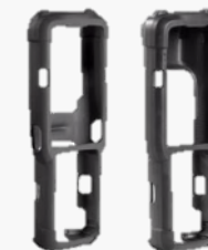
Protective boot for Gun/Straight Shooter (Brick)