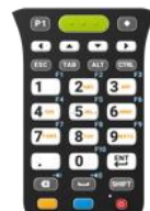
Numeric (29 key)