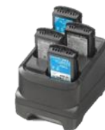
4-Slot Battery charger Shared MC33/MC34