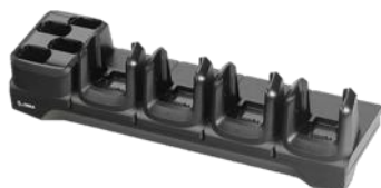
Multi-slot charge only cradle with and without Battery charger Shared MC33/MC34

Backwards compatibility with MC3300 Series chargers and batteries preserves your existing accessory investment