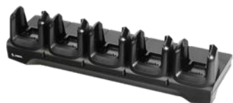
Multi-slot Ethernet cradle with and without Battery charger Shared MC33/MC34