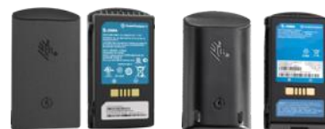
7000mAh STD and BLE batteries Shared MC33/MC34